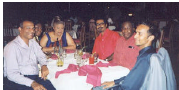
Workshop participants from Jamaica and Trinidad & Tobago enjoying some social time.

The Network Steering Committee (NSC) that was established has guided the production of a CD of the Proceedings of the Workshop. Approximately 100 copies of the CD have been distributed to all participants of the Workshop including some institutional representatives.