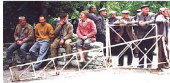
Farmers in the town of Pasanauri, Republic of Georgia, waiting to receive their certificates of land ownership.

provide financial and project management development in order to position the Association for the Protection of Land Owner’s Rights (APLR) to assume full operational responsibility for the registration of ownership of approximately 1,130,000 agricultural parcels and 270,000 residential parcels.