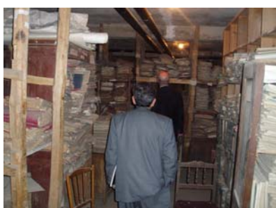
Visitors tour a typical Makhzan in Kabul Afghanistan

The Spatial Information Team will also be responsible for database development. This involves assembling a project team of Afghani subject matter and technical experts, defining the functional and technical requirements of the database system, determining hardware and telecommunications requirements, designing and building the database system, and training users to use the database. The goal is to have user-friendly software for scanning-indexing and creation of a legal database which will link legal and graphic (spatial) information presently contained in the Makhzan archives, entry of data for 3,000 deeds, training of around fifty users of the software, plus training materials and documentation for the application.