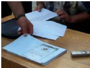
Over 2.4 million Land Title Registration Certificates were issued during the life of the Georgia Land Market Development Project

information services, and 6) to continue financial management development.