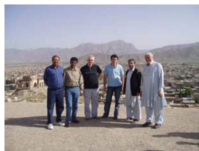
Terra staff and local counterparts overlooking Kabul, Afghanistan

Afghanistan is a country badly battered by the upheavals of the past quarter century. The current Transitional Administration is attempting to rebuild the country's infrastructure but the government's grasp does not extend much beyond the capital city's (Kabul) limits and much remains to be done. A key part of restoring economic development and stable government institutions is making sure there is clear title to immovable property. Deed registries (Makhzan) are kept at the Afghan Supreme Court and provincial courts, but they are in disarray. Changes in ownership, warlords, war, squatters, refugee return, and economic crises have complicated Afghanistan's property system. In addition, Afghanistan's justice system, which deals primarily with property ownership disputes, is a mix of state law, religious law, and informal local dispute resolution.